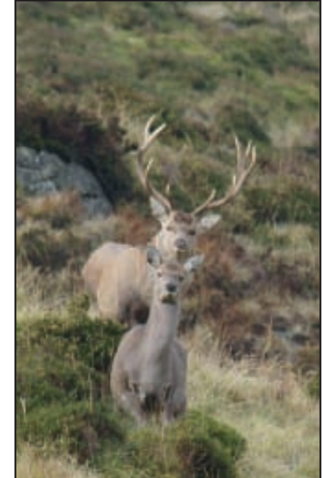
Stag and hind on the Wicklow Mountains.

The key components of this strategy include generating good data on an ongoing basis on deer numbers and trends, education of forest managers regarding deer ecology behaviour and management, and culling where populations are unsustainably high. An agreed management strategy, if implemented fully, would also address the poaching of deer which has serious negative impacts on the future viability of deer herds.