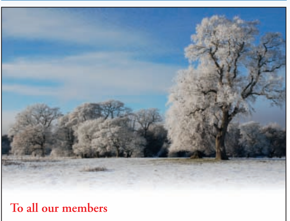
To all our members Nollaig shona is gach sonas i gcomhair na h-athbhliana Happy Christmas and a Prosperous New Year