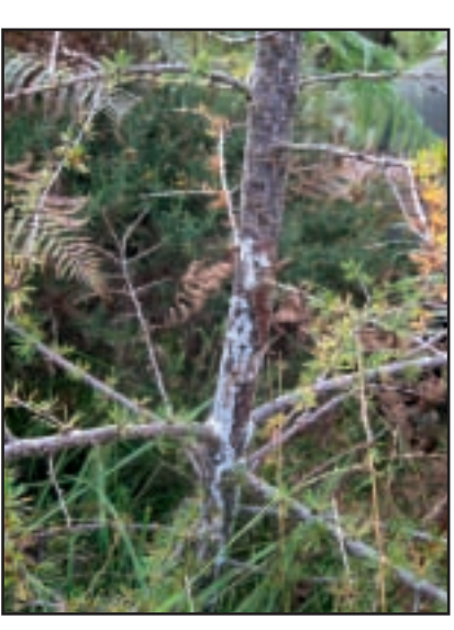
their upper trunks.

The Forest Service divisions in the Republic and Northern Ireland have appealed to woodland owners and managers to remain vigilant and report suspicious symptoms. The first indication of the disease on Japanese larch trees is a visible wilting of young shoots and foliage, or later in the growing season, withered shoot tips with yellowing needles, which then become blackened. The infected shoots shed their needles prematurely. Trees may also have bleeding cankers on their upper trunks. While the bleeding canker can be detected throughout the year, foresters and growers will have to wait until the spring, when larch begins to flush. However, growers should inspect their plantations throughout the year.