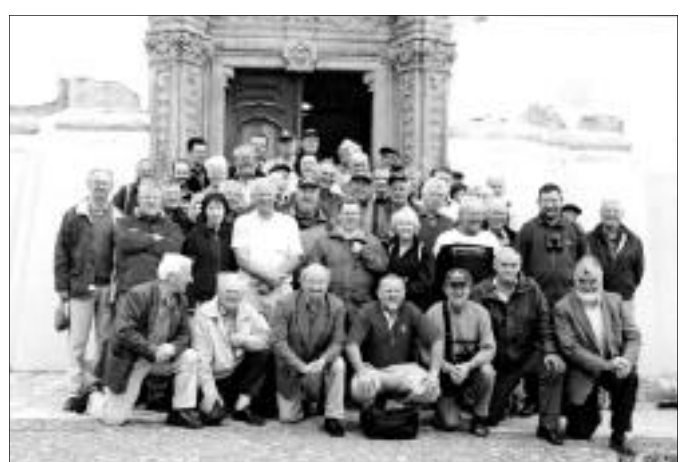
Society members on the annual study tour which visited Hungary in September earlier this year.

The Society of Irish Foresters continues to play a very active role with IFIC in ongoing negotiations with the Forest Service. Some of the issues currently under discussion between the Society of Irish Foresters and the Forest Service are as follows: